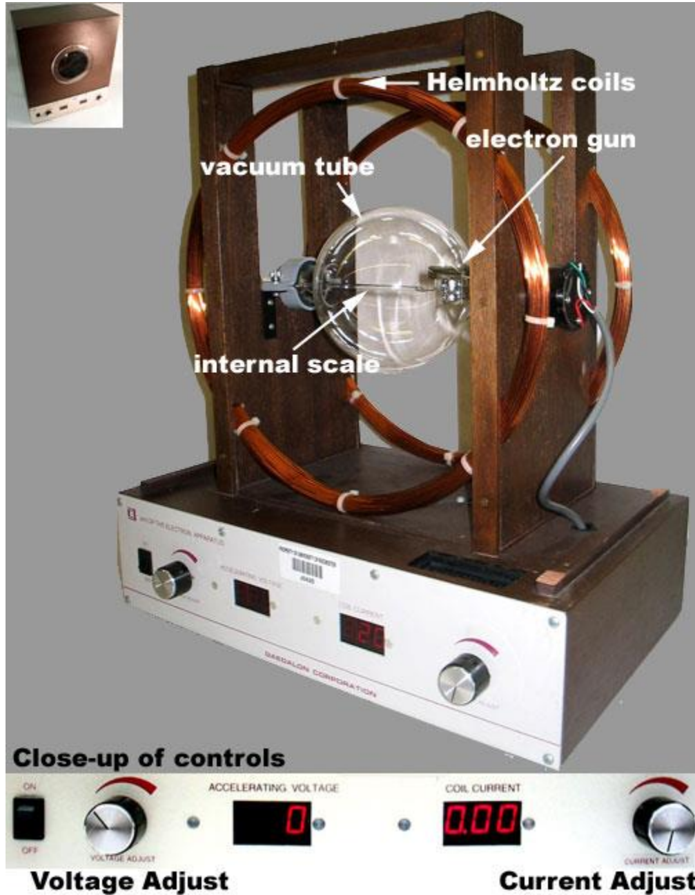
Figure 8. 1

graduations and numerals of the scale are illuminated by the collision of the electrons, making observation and reading easier.