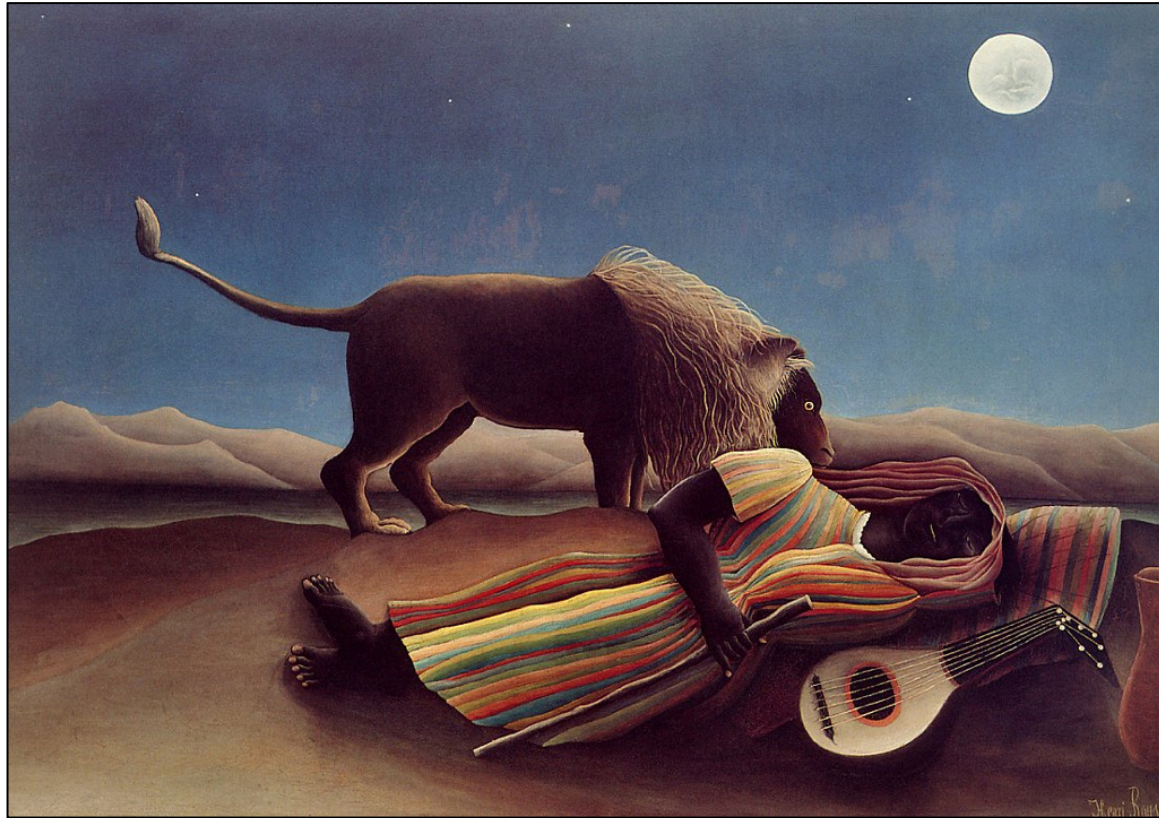
Henri Rousseau, The Sleeping Gypsy