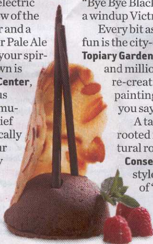
CREATIVE CUISINE Dessert as art at The Refectory

of the Opera jealous. For a little comic relief from all this high culture, duck into the Thurber House , where author and cartoonist James Thurber and his family lived. Their life and hard times have been frozen in time so visitors can sit back in Victorian-era chairs, bounce on beds or play "Bye Bye Blackbird" on a windup Victrola. Every bit as much fun is the city-owned Topiary Garden , a 3-D and million-leaved re-creation of pointillist Georges Seurat's lush painting of a Sunday afternoon in France. Can you say plants with hats? A tad more high-minded but also firmly rooted in the city's horticultural and agricultural roots is the multi-paned Franklin Park Conservatory . The 1895 Chicago Exposition-style glass palace houses 73,000 square feet of "biomes," from the rarest of orchids →