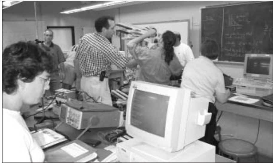
Teachers in action during a recent summer institute held at our department

High school students become involved through research performed at their schools or by participating through internships at the University. The expanding list of research topics for students includes determining the lifetime of muons, studying absorption of muons