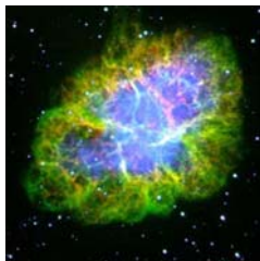
The Crab Nebula, M1 – the remnant of the supernova of 1054 – emits much of its visible radiation by acceleration of electrons in magnetic fields.